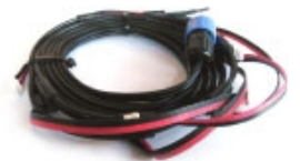
DC Power Cable