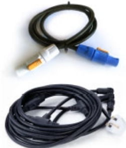
AC Power Cable